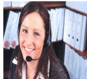
Our hotline counselors connect callers to emergency food resources in their area.

In addition to calling the hotline, people in need can also reach hotline counselors by instant message through www.gettingsnap.org .