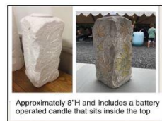
Approximately 8"H and includes a battery operated candle that sits inside the top