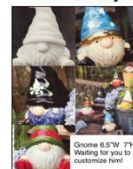
Gnome 6.5"W 7"H (Waiting for you to customize him!)